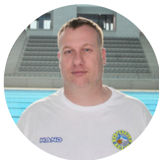
VD Koper President

After your initial contact, you will receive detailed registration information.