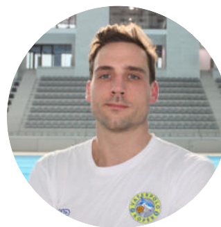
VD Koper Sports Director